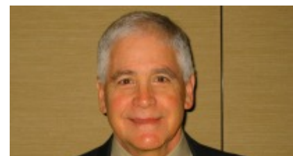
Message from AMCP Foundation President