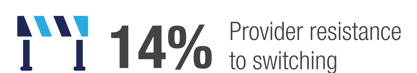
Figure 4. Patient-Reported Experiences With Understanding and Navigating Insurance Coverage for Biologics and Biosimilars